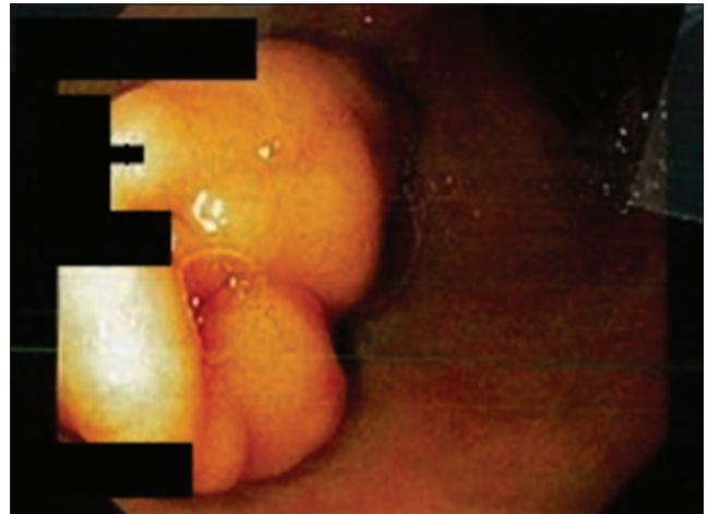
Figure 2: Esophagogastroduodenoscopy (EGD) picture 2

an asymptomatic hamartoma is not clear, their increasing size may result in complications of obstruction or hemorrhage as well as a potential for malignant transformation. This is reason enough for removal. [13]