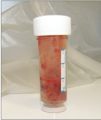
Figure 5: Aspiration of blood-stained necrotic debris from the left neck swelling