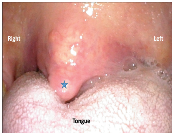
Figure 1: The left lateral pharyngeal wall is enlarged and pushed medially moving the uvula to the right (blue star)

He was subsequently reviewed by ENT surgeons where he reported a 4-week history of sore throat, hoarse voice, and dysphagia to both solids and fluids. On examination, the left lateral pharyngeal wall showed a medial displacement [Figure 1]. There was a 5 cm left upper neck swelling involving the Level II and III [Figure 2]. There were no palpable cervical lymph nodes or any other palpable abnormality in his neck. A flexible pharyngolaryngoscopy revealed a left lateral pharyngeal wall submucosal swelling, left vocal cord palsy, and pooling of saliva in the pharynx [Figure 3].