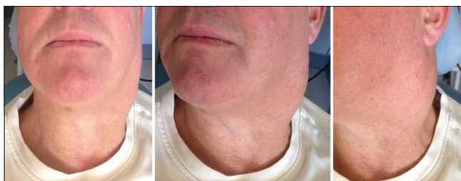
Figure 2: Left upper neck swelling involving the Level II and III

The upper gastrointestinal endoscopy and biopsy revealed esophageal candidiasis for which he was treated with fluconazole.